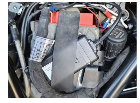
EZTrac™ HE Installed on asset