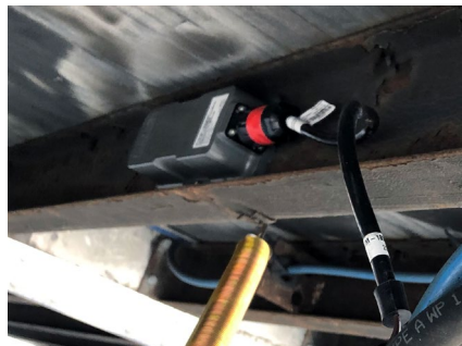
StealthNet Installed on Chassis