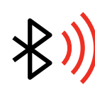
Unlimited Bluetooth Connectivity