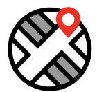
GPS, Geofencing, Route Tracking