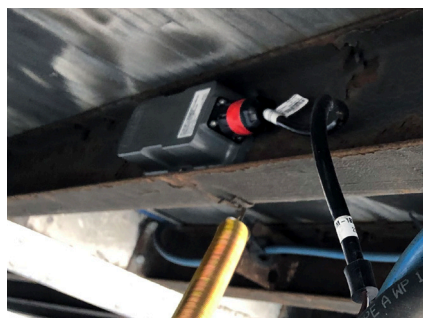
StealthNet Installed on Chassis