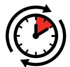
10 Minute Installation