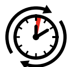
2 Minute Installation