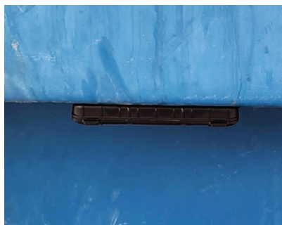
AssetTrac™ Installed on asset